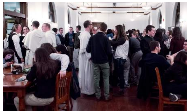
Friars with March for Life pilgrims at the Dominican House of Studies, Washington, D.C.

No matter what brought them in the door, once these young people crammed into the Chapel, they experienced a slice of the vibrant liturgical life of the Dominican Order: the ancient chanted prayers of the Divine Office, the steady rhythms of the Rosary, and the beautiful polyphony of our friars' schola. After Compline, many of the students waited to get pizza—surely a work of grace!—in