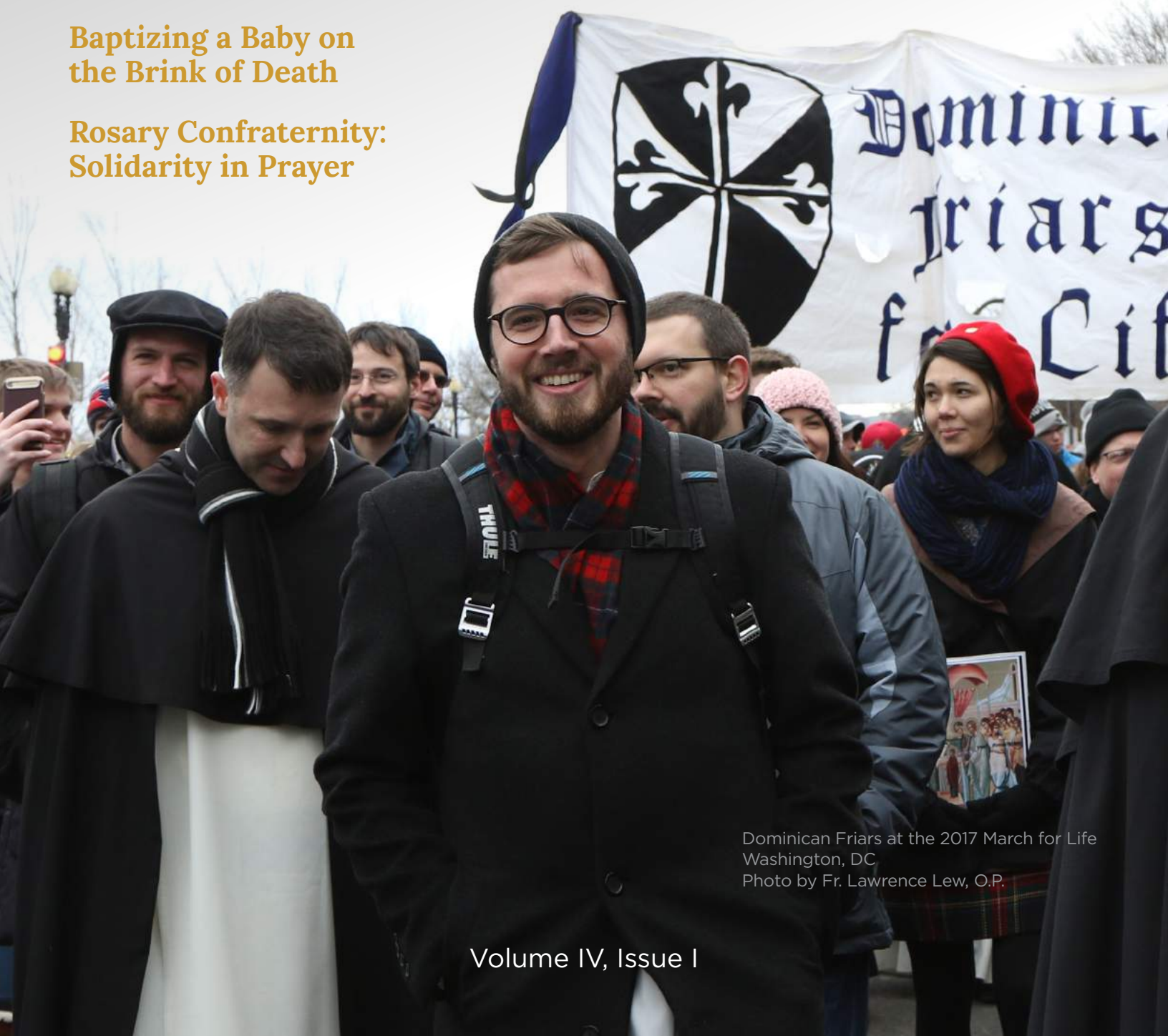
Dominican Friars at the 2017 March for Life Washington, DC

Rosary Confraternity: Solidarity in Prayer