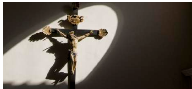
Outside St. Dominic's Cell, Santa Sabina, Rome