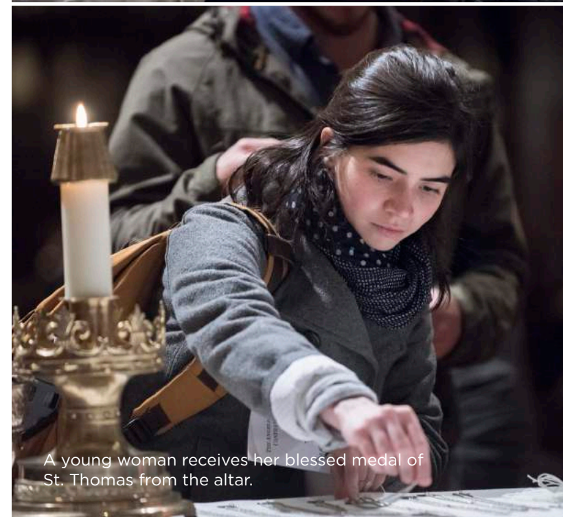
A young woman receives her blessed medal of St. Thomas from the altar.