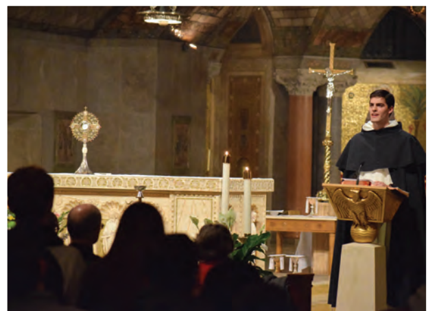
A Dominican student brother preaches at holy hour in the crypt of the Basilica of the National Shrine of the Immaculate Conception on the morning of the March.

After the March, the student brothers returned to the House of Studies, the Priory of the Immaculate Conception, to continue our life of regular observance. In a Dominican chapel, contemplation flows into preaching for the salvation of souls. There too, Christ draws all to Himself and pours out His graces and blessings.