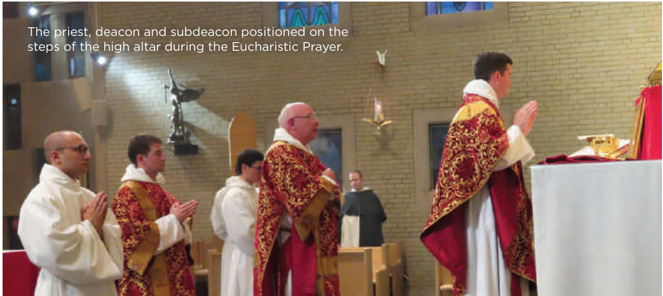
The priest, deacon and subdeacon positioned on the steps of the high altar during the Eucharistic Prayer.

activity of the deacon, subdeacon, and acolytes. Their roles are significantly augmented in the Dominican Rite, as compared to the Roman, in order to minimize the amount of tasks to which the priest celebrant needs to attend. The point is to preserve an atmosphere of contemplation for the priest—his job is to keep his mind on God and his heart in communion with God, and so to offer the Divine Sacrifice all the more worthily on behalf of the whole Church. One example of this is the way the deacon and subdeacon prepare the chalice and altar while the priest is sitting down, bringing the various instruments to him to receive his blessing.