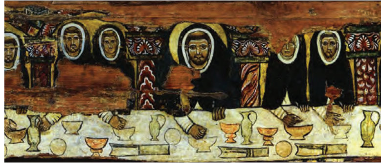
The table kept in the Church of Santa Maria della Mascarella in Bologna bears the earliest known painting of St. Dominic.

In St. Gregory the Great’s interpretation of this Gospel passage, the servant is an ‘order of preachers,’ who must be sent, in the last times,