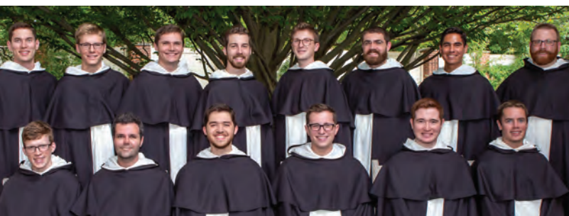
14 men entered our novitiate on August 8.